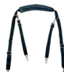
Harness strap AT-CAE1207B