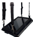
Harness carrying case AT-CAE8010