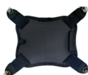
Hand strap AT-CART81A07