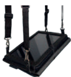
Harness carrying case AT-CAE8L05