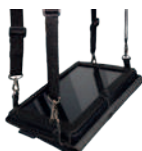
Harness carrying case AT-CAE702