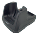
Destock dock AT-CART5501

Removable battery, very rugged, integrated hand strap, Full HD display, USB-C.