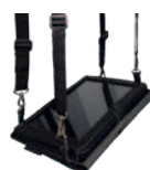
Harness carrying case AT-CAE1013