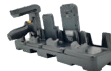
4 slots desktop dock