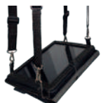
Harness carrying case AT-CAE10L01