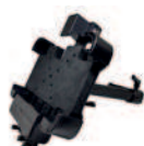
E10B Vehicle dock with key lock, Ethernet, DC jack, 2 USB, RS232 DB9, kit fixation AT-CAE1011B AT-CAE1011B1