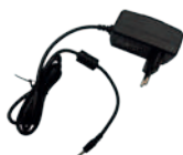
Power adapter AT-CAE805