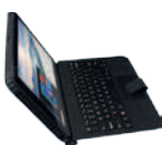
Removable QWERTY keyboard AT-CAE1210