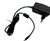
Power adapter 5V AT-CAE805