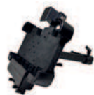
Vehicle Dock AT-CAE8011B